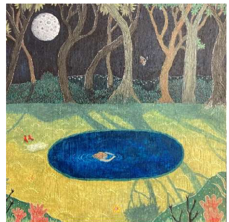
Hannah Battershell Skinny Dipping , 2022

Acrylic and ink on paper relief collage, Meccano, vintage marmite box, antique photographic plate holder 22 x 24 x 9 cm